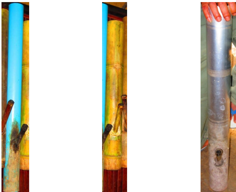
(a) PVC Pipe Waterpipe (b) Bamboo Waterpipe (c) Metal Piping Waterpipe

Current data suggest that the use of a common mouthpiece or smoke convection path ( i.e. , through a hose or bamboo pipe) by manufactured waterpipe users increases the risk of acquiring herpes simplex virus (HSV-1), Epstein Barr [19], Helicobacter pylori [14], hepatitis B, various respiratory infections, including bacterial meningitis [13], and periodontal conditions such as oral candida [15,20]. There have also been confirmed cases of tuberculosis spread through communal use of a waterpipe [21]. This adds to the evidence from South Asia and the surrounding regions linking tobacco smoking to an important burden of tuberculosis infections [13,21,22].